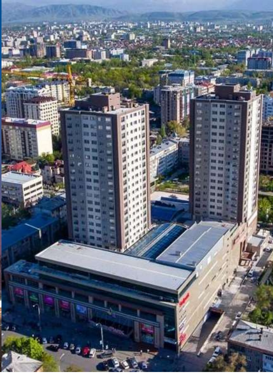
Bishkek Park Complex