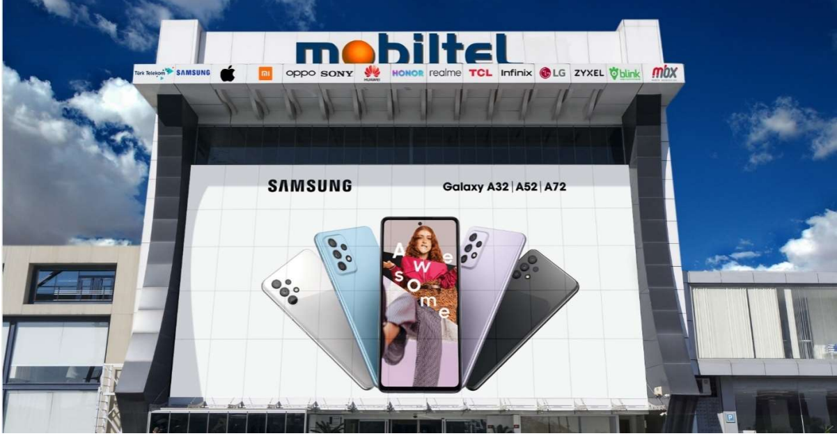
Mobitel Building – Çobançeşme E5 Highway / Istanbul

Until 2019, the subsidiary Mobil Turizm Yatırım A.Ş. operated retail stores in Istanbul to retail and wholesale mobile phones, phone accessories and operator products, and recently focused on real estate investments and projects. Mobil Turizm Yatırım A.Ş. has an office building of 2.410 m2 at No:16/A Yenibosna-Bahçelievler-Istanbul and rents this building to companies.