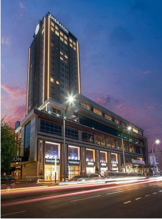
Bishkek Park Complex